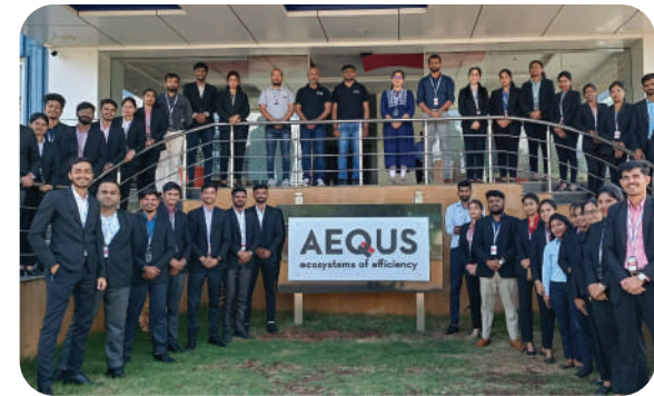
Industrial Visit - AEQUS: Leading India's Foray into Global Scale Manufacturing of World-Class Consumer Durable Goods