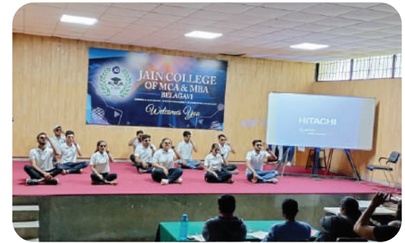
Cultural fest performance during the Cultural feista