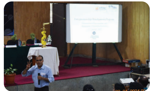
ED sessions- The session featured inspiring stories from successful entrepreneurs, interactive workshops, and networking opportunities.