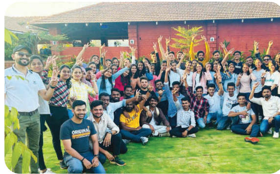
Student Outbound Program: Shoonya Retreat: Celebrating Unity and Adventure. Creating Unforgettable Experiences and Lifelong Friendships