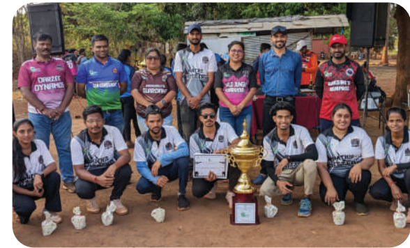
JPL (Jain Premier League): Celebrating Team Spirit and Sportsmanship at JGI College's Exciting Cricket Tournament.