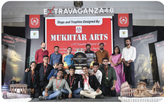
National Level Management Fun Event - Extravaganza 4.0: Celebrating Triumphs and Skills with Exciting Management Competitions