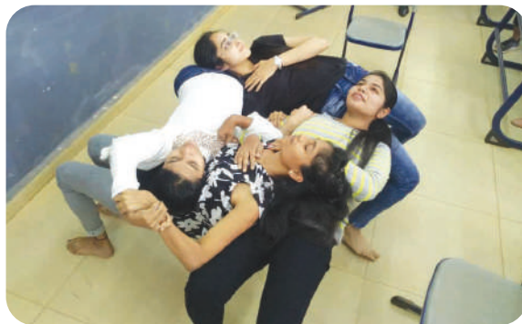
Orientation Session-The session provided a solid foundation for students to start their academic journey with confidence, clarity, and excitement.