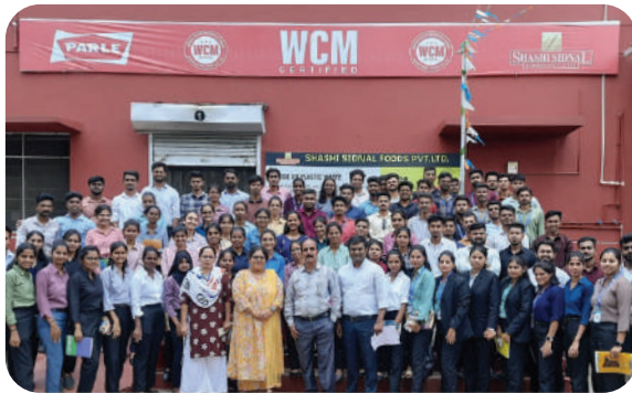
Industrial Visit - Parle Biscuit Factory: Gaining Insights into the Manufacturing Process and Industry Practices with Students.