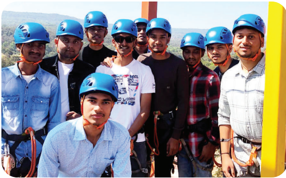
Student Outbound Adventure: Conquering Heights at West Hills Resort. Building Team Spirit and Resilience Through Thrilling Activities.