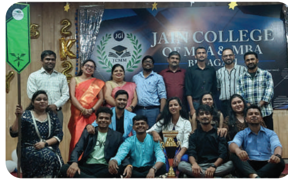
General champions for the inhouse fest