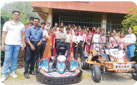
Industrial Visit - KNK Karts: Gaining Insights into the Manufacturing Process and Industry Practices with Students.