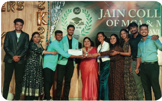
Pravartak- an in house management fest, designed to invoke the talent of the next gen.