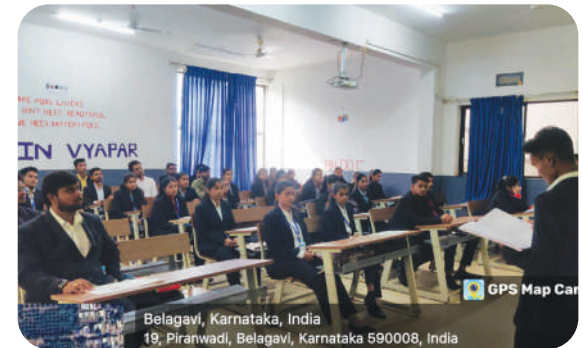
CBR-offers opportunities for businesses to innovate, adapt, and thrive in a rapidly changing environment.