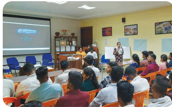
Industrial Visit - Interactive Session: Engaging Discussion with Factory Staff. Enhancing Learning through Real-World Industry Insights.