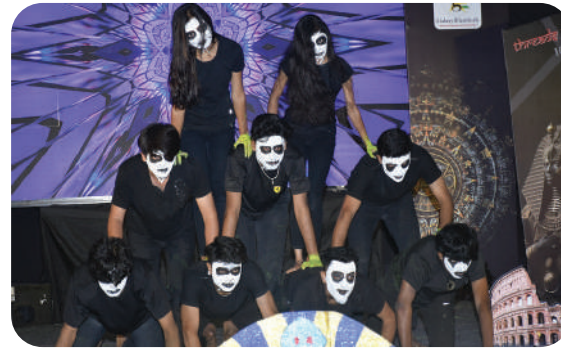
National Level Management Fun Event - Extravaganza 2.0: Showcasing Talent and Creativity Through Exciting Performances