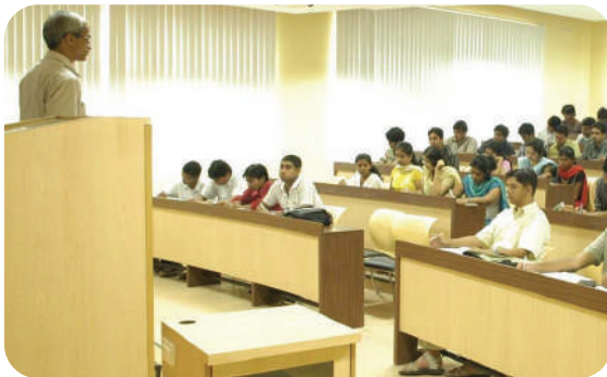
Guest Lectures- Innovative Learning: Interactive Sessions at College. Shaping Future Leaders Through Quality Education and Engaging Lectures.