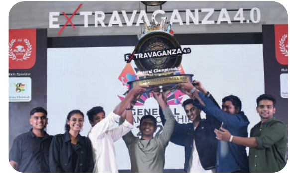
National Level Management Fun Event - Extravaganza 4.0: Celebrating Triumphs and Skills with Exciting Management Competitions