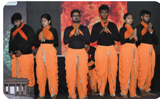
National Level Management Fun Event: Extravaganza 3.0. Blending Cultural Performances with Engaging Management Activities